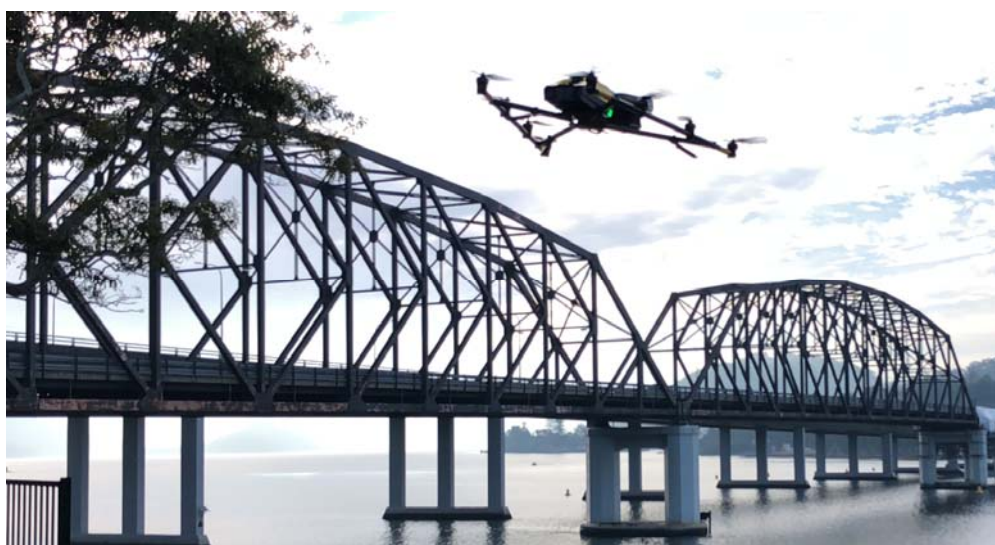
Figure 1 Drone Inspection of Peats Ferry Bridge

The use of drones is one such technology, favored for their features of safety, functionality and sustainability in the processes of infrastructure inspection. Building this bank of proof is necessary for government organisations and transportation agencies looking to move bridge inspection into the 21st century.