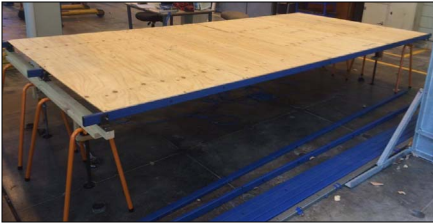
Figure 1: Dimensions of Experimental Bridge System

The data acquisition was completed by dividing the girder into ten even sections with eleven node points at 0.4 m spacing. As the two end nodes were supports, measurements were not required for these nodes and accelerometers were placed at nodes 2 to 10 only. The damage that was induced involved cutting directly into the soffit of the steel RHS. Specifically, a damage that consisted of a 20 mm deep rectangular cut. All of damage scenarios that were investigated are summarised in Tables 1 and 2 Table for the single girder and scaled bridge system respectively.