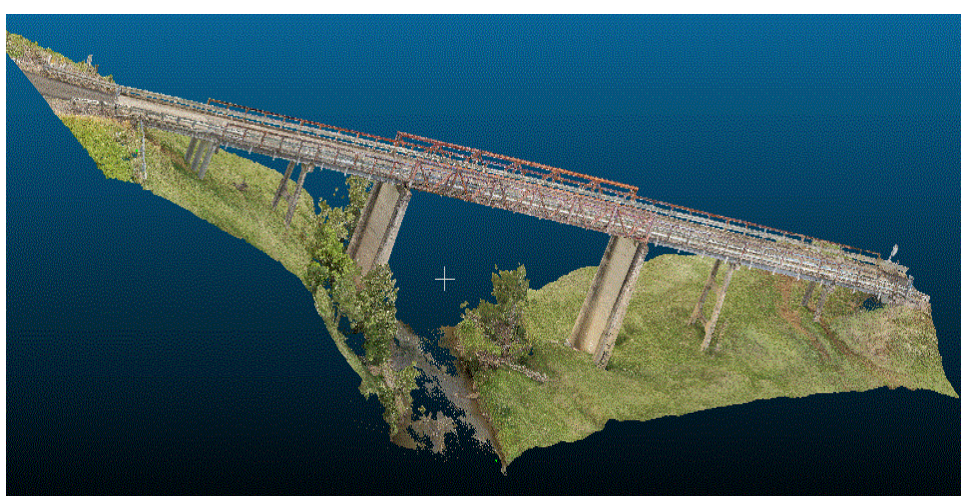
Figure 2 Point Cloud of Cedar Point Bridge

Drone images from multiple locations and point clouds can be used to construct 3D models using the photogrammetry tools and techniques. These drone models can be employed for virtual inspection and also as-built model development of bridges. Figure 2 shows the constructed point cloud of cedar point bridge in NSW.